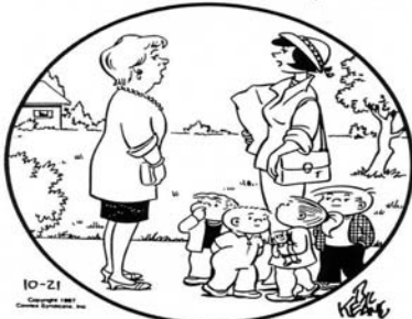
THE FAMILY CIRCUS By Bil Keane

"How do you divide your love among four children?" "I don't divide it. I multiply it."